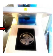
Heat Press (2 nd step)